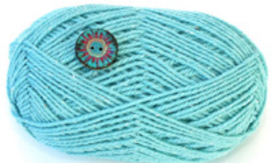
Kenzie: 1022 - Ruapehu Button: BU1732C23