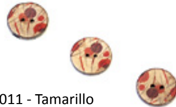
Kenzie: 1011 - Tamarillo Button: BS1075C23