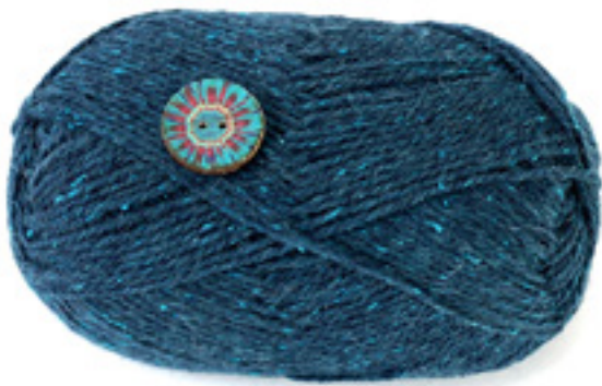
Kenzie: 1013 - Tekapo Button: BU1732C23