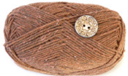
Kenzie: 1021 - Collingwood Button: BS1051C25