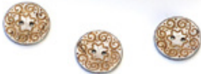
Kenzie: 1000 - Pavlova Button: BS1051C25