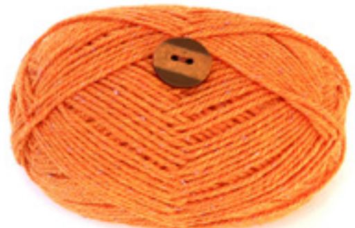
Kenzie: 1006 - Kumara Button: BU1559P23