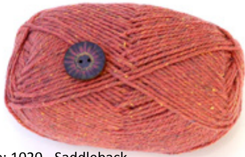
Kenzie: 1020 - Saddleback Button: BU1736C23