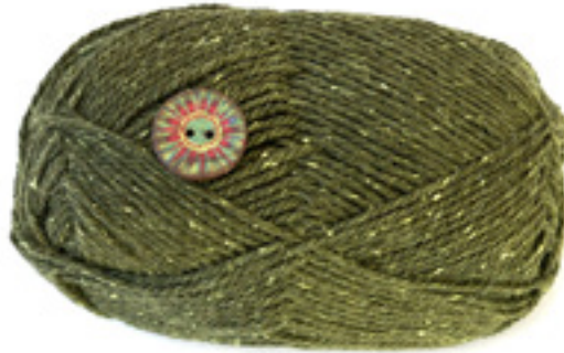
Kenzie: 1026 - Kea Button: BU1734C23