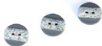
Kenzie: 1002 - Grey Salt Button: BU1575P23