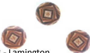
Kenzie: 1003 - Lamington Button: BS1269P23