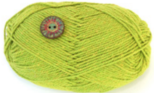
Kenzie: 1025 - Elean Button: BU1734C23