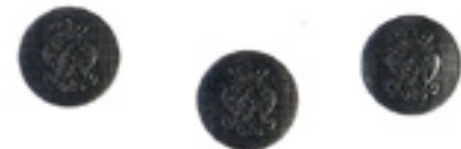
Kenzie: 1027 - Takahe Button: BS1265P23