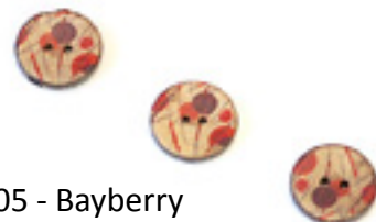
Kenzie: 1005 - Bayberry Button: BS1075C23