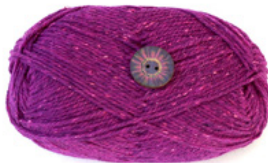
Kenzie: 1015 - Boysenberry Button: BU1736C23