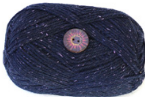
Kenzie: 1014 - Malbec Button: BU1736C23