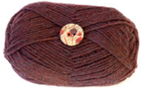
Kenzie: 1012 - Chestnut Button: BS1075C23