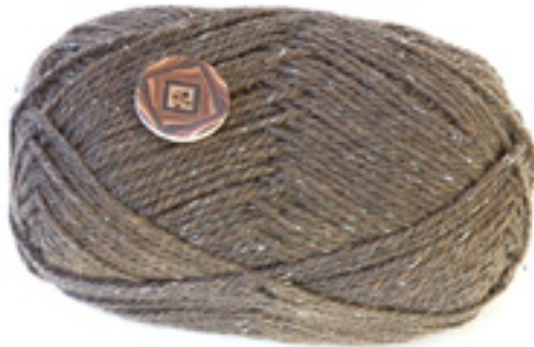
Kenzie: 1023 - Wombat Button: BS1269P23